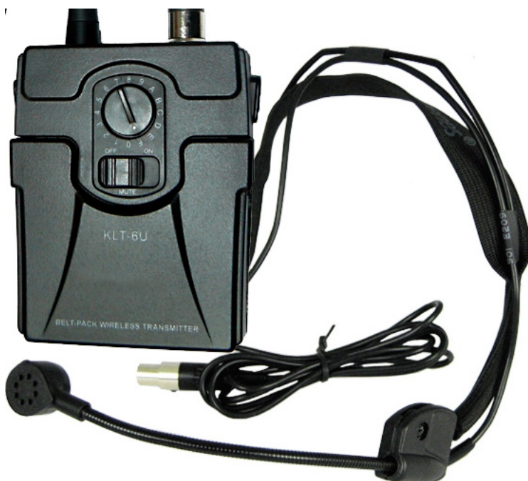
Headset microphone system HAT-1C/KLT-6U, 863 MHz – 865 MHz (EU public domain frequencies).