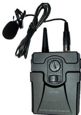
KLT-6U Lavalier- resp. CLIP radio microphone system KLT-6U.