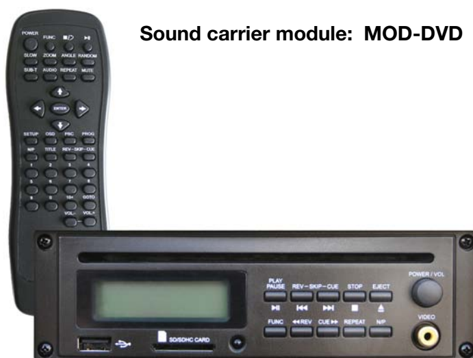
Sound carrier module: MOD-DVD