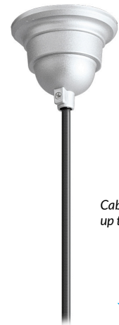
Cable length up to 5 mtrs.