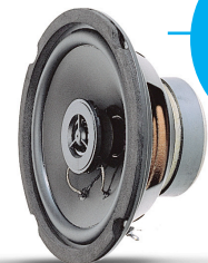
Fig.: 2-way coaxial chassis