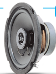
Fig.: 2-way coaxial chassis