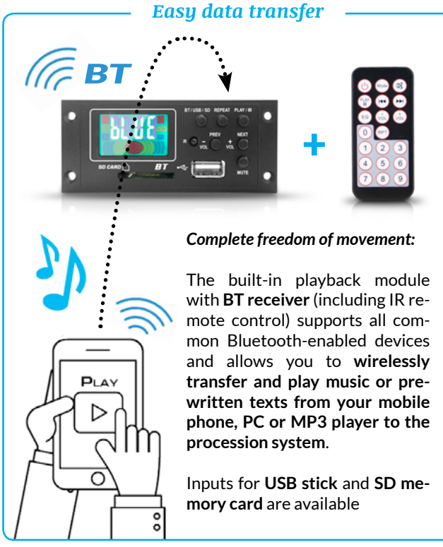
Fig.: Playback module (with BT receiver, inputs for USB stick + SD card) & remote control

The built-in playback module with BT receiver (player for USB sticks, SD memory cards and for audio transmission using all common Bluetooth-enabled devices) will provide you with optimal support during use.