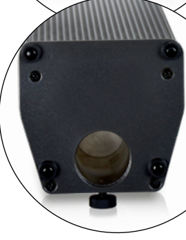
top device top below device bottom left ZP-4D+2X (SET) rear side with controls