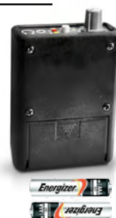
Fig.: ILA-E battery compartment for 2 x 1.5 V (AA)