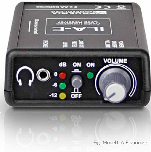
Fig.: Model ILA-E, various side views