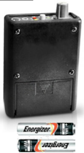
Fig.: ILA-E battery compartment for 2 x 1.5 V (AA)